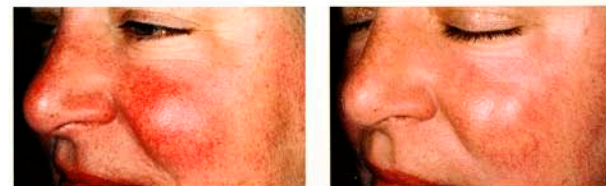
Broken Capillaries — After 2 IPL treatments